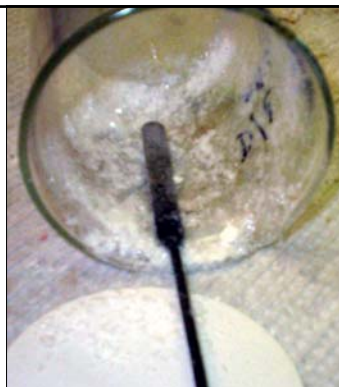
Recrystallized unknown solid from previous three lab periods