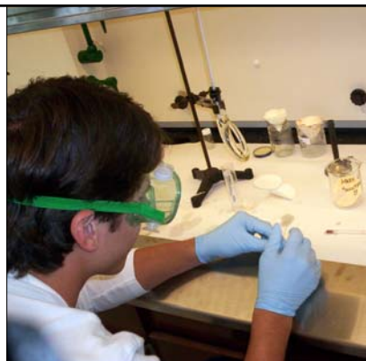
Packing capillary tubes with unknown solid